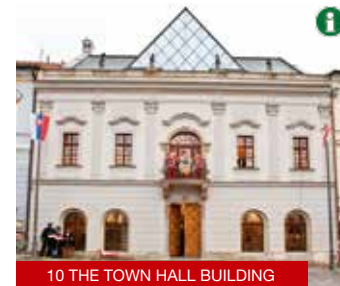
10 THE TOWN HALL BUILDING