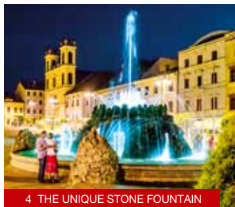
4 THE UNIQUE STONE FOUNTAIN