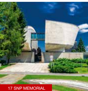
17 SNP MEMORIAL

16 The Dominik Skutecky House is a villa constructed in a neo-Renaissance style at the turn of the 19th century and serves as exhibition space for the works of Dominik Skutecky, one of the major realist painters in Central Europe at the turn of the 19th and 20th centuries. www.ssgbb.sk