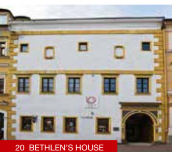
20 BETHLEN'S HOUSE

18 County house – This imposing building was created from two originally Renaissance-style buildings and a Baroque addition in the second half of the 18th century. The building in the past served as the administrative offices for Zvolen County and is currently home to the State Science Library and the Literary and Musical Museum. www.svkbb.eu