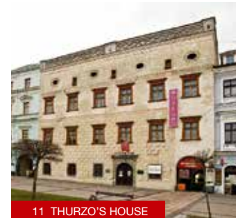
11 THURZO'S HOUSE