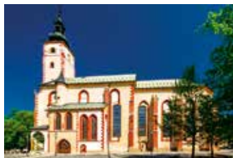
6 THE CHURCH OF THE VIRGIN MARY'S ASCENSION